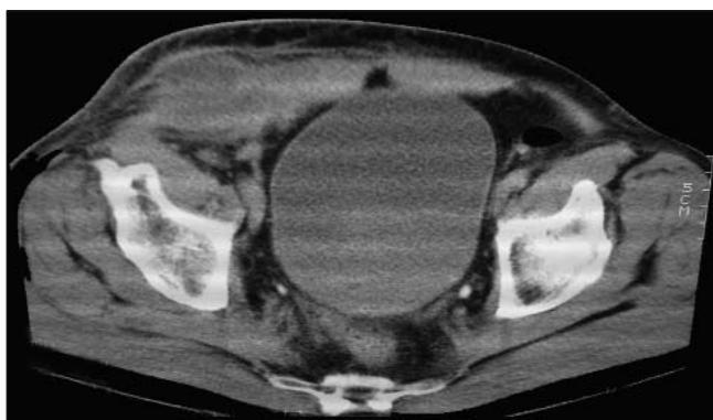
Figure 2. CT shows a preperitoneal mass about 3 cm in diameter