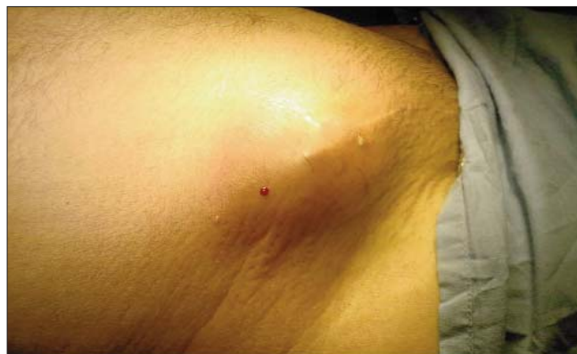
Figure 1. The gross view of swelling

Delikoukos et al (3) revealed the late onset mesh infection did not correlate to either type of prosthetic material inserted or the suture material used. Removal of the complete or partial prosthetic mesh material is usually required to control the infection. Hernia recurrence is a concern after removing the mesh for an eventual infection control. Fawole et al